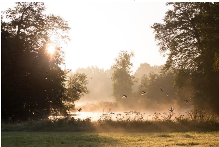
Figure 6 Reserve, Stichting Behoud Natuur en Leefmilieu Vlaanderen

LAND TRUST, SUBSIDIES, PRIVATE (RESTORATION) MANAGEMENT OF PUBLIC LAND