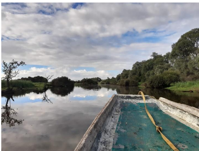
Figure 4 Boat tour Plaines de Mazerolles