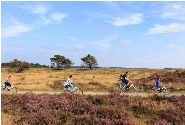
Figure 3 Tourists in National Park De Hoge Veluwe