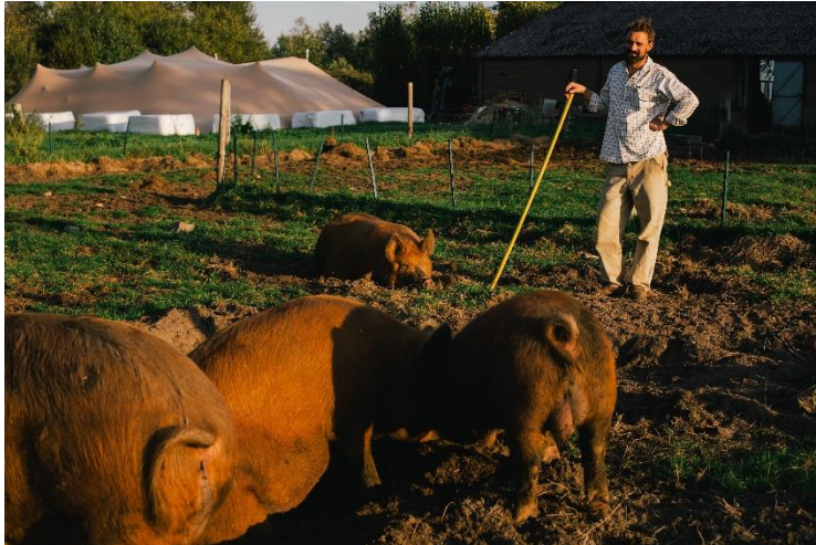
Figure 7 Vrijshof

The Vrijshof is located against the backdrop of the hiking and nature reserve "De Vuile Plas" in Kontich. On the land and in the buildings, the family tries to work out a permaculture project in harmony with their environment, complemented by principles from the circular economy and in compliance with the legislation for organic production. The principles of circular production are possible because of the management combination of agriculture, nature and forest land. Through a management agreement with the competent authority the family uses parts of public land in their system. They restore the biodiversity values of the land while using the land's outcomes for free. In return the Vrijshof has to develop an approved conservation plan and manage the land according to this. They must (if possible) use all outputs of the forest management in their circular business.