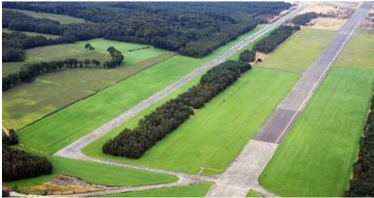
Figure 5 NATO Airfield Malle

For more than a half century the airfield in Malle has been in use by NATO for military activities. Today its use is multifunctional including a private flying club, sport manifestations, scouting, air shows, vehicle testing, photo shoots, walking and nature conservation. The Land Is For Ever LIFE+ project was able to bring together the surrounding private owners who were expropriated for the realization of the airport together with Natuurpunt, Flanders' largest nature organization and PIDPA, a drinking water company that pumps water in the area for the drinking water supply of Flanders. Under the mediation of the LIFE + project, a first cooperation agreement has been signed and the partners are jointly working towards a common vision on and management of the area's nature.